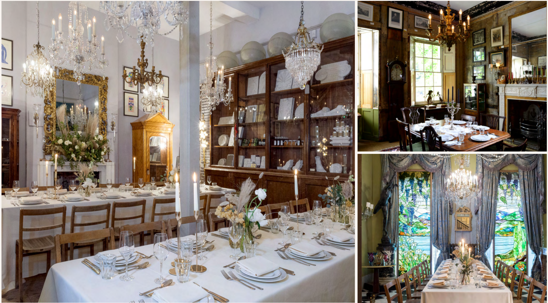
Left: Library – 28 seated / 60 standing. Top right: Study - 12 seated / 20 standing. Bottom right: Parlour – 14 seated / 30 standing. Please visit brunswickhouse.london/events for photos of our Garden and more images of our private spaces.