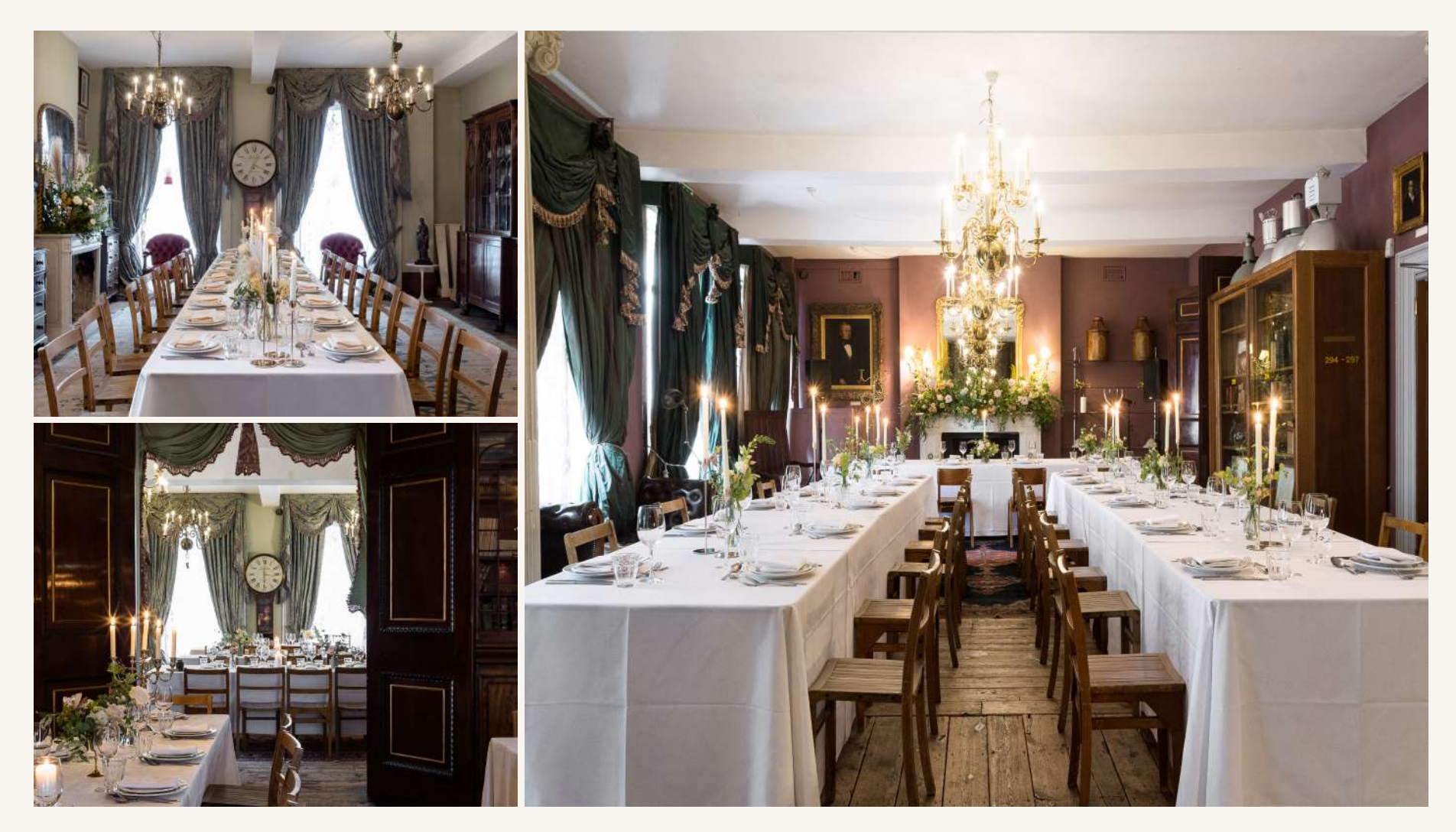
Top left: Smoking Room – 22 seated. Bottom left: Saloon & Smoking Room – 110 seated / 120 standing. Right: Saloon – 70 seated / 80 standing Saloon Roof Terrace – 30 standing. Please visit brunswickhouse.london/events for photos of the Saloon Roof Terrace and more images of our private spaces.