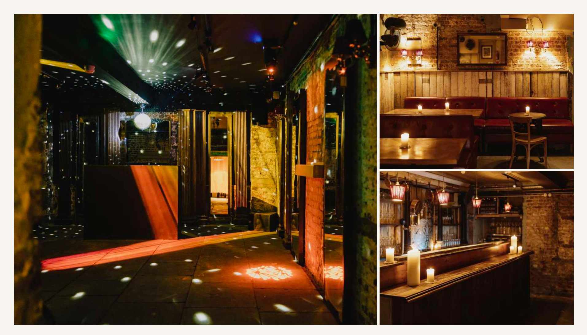
Left: Cellar dancefloor. Top right: Cellar bar. Bottom right: Cellar bar. Capacity: 120 standing. Please visit brunswickhouse.london/events for more images of our private spaces.