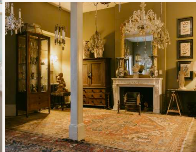
Left: Parlour. Top right: Parlour. Bottom right: Library. Please visit brunswickhouse.london/events for photos of the Study and more images of our private spaces.