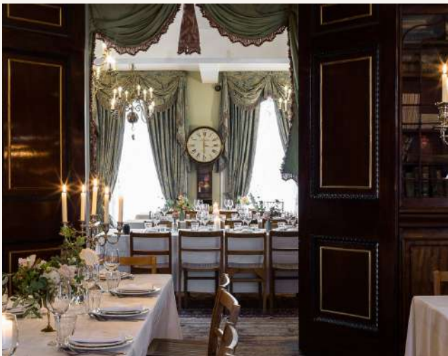
Top left & right: Saloon – 70 seated / 80 standing Bottom left: Smoking Room – 40 seated / 70 standing Smoking Room & Saloon – 110 seated / 120 standing Saloon Roof Terrace – 30 standing Please visit brunswickhouse.london/events for photos of the Saloon Terrace and more images of our private spaces.