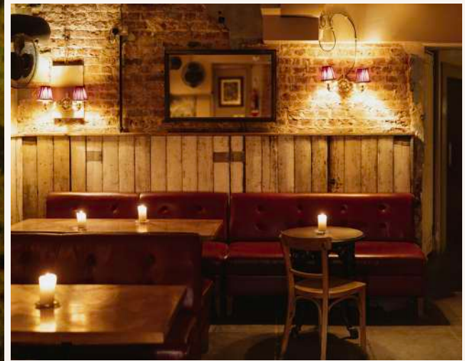
Left: Cellar dancefloor. Top right: Cellar bar. Bottom right: Cellar bar. Capacity: 120 standing. Please visit brunswickhouse.london/events for more images of our private spaces.