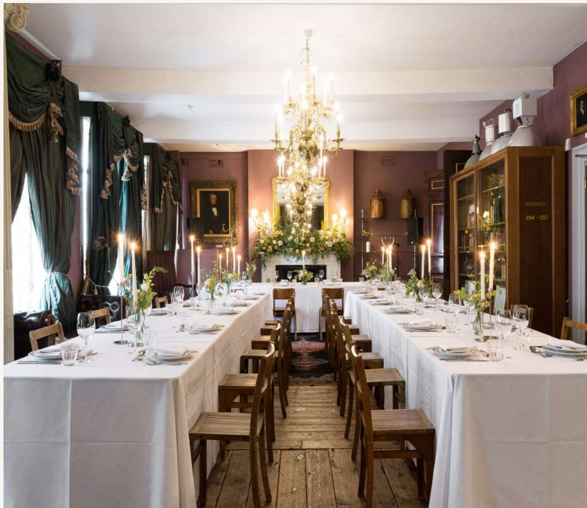
Top left: Smoking Room – 22 seated. Bottom left: Saloon & Smoking Room – 110 seated / 120 standing Right: Saloon – 70 seated / 80 standing Saloon Roof Terrace – 30 standing Please visit brunswickhouse.london/events for photos of the Saloon Roof Terrace and more images of our private spaces.