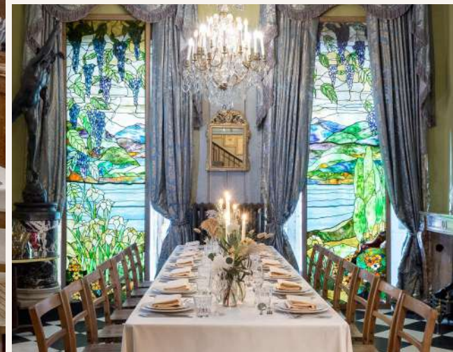
Left: Library – 30 seated. Top right: Parlour – pre-meal standing. Bottom right: Parlour – 16 seated. Please visit brunswickhouse.london/events for more images of our private spaces.