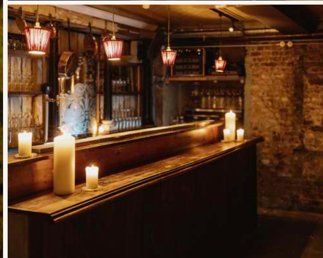
Left: Cellar dancefloor. Top right: Cellar bar. Bottom right: Cellar bar. Capacity: 120 standing. Please visit brunswickhouse.london/events for more images of our private spaces.