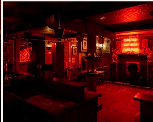
Left: Cellar dancefloor. Top right: Cellar vault room. Bottom right: Cellar bar. Capacity: 120 standing. Please visit brunswickhouse.london/events for more images of our private spaces.