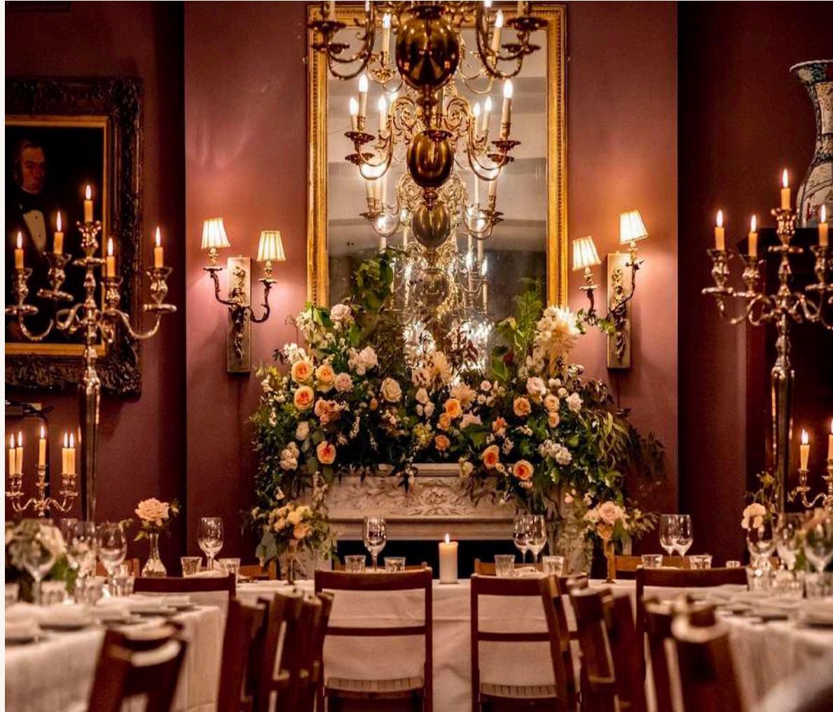
Top left: Smoking Room – 22 seated. Bottom left: Saloon & Smoking Room – 110 seated / 120 standing Right: Saloon – 70 seated / 80 standing Saloon Roof Terrace – 30 standing Please visit brunswickhouse.london/events for photos of the Saloon Roof Terrace and more images of our private spaces.