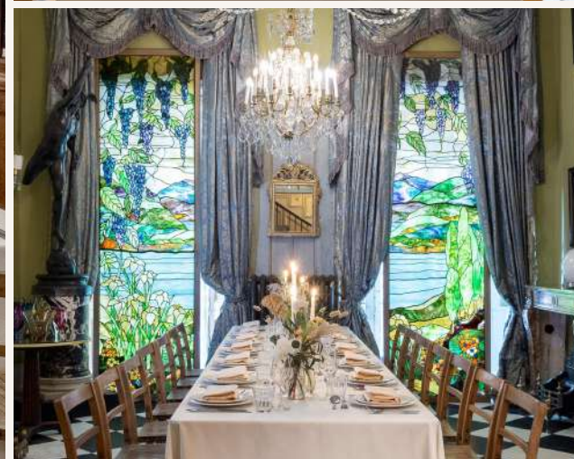
Left: Library – 30 seated. Top right: Parlour – pre-meal standing. Bottom right: Parlour – 16 seated. Please visit brunswickhouse.london/events for more images of our private spaces.