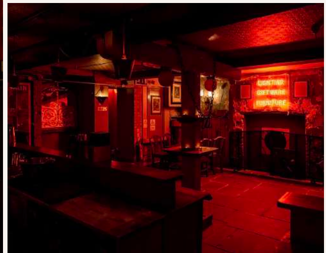
Left: Cellar dancefloor. Top right: Cellar vault room. Bottom right: Cellar bar. Capacity: 120 standing. Please visit brunswickhouse.london/events for more images of our private spaces.